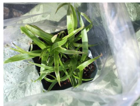
Aechmea metertensii seedlings