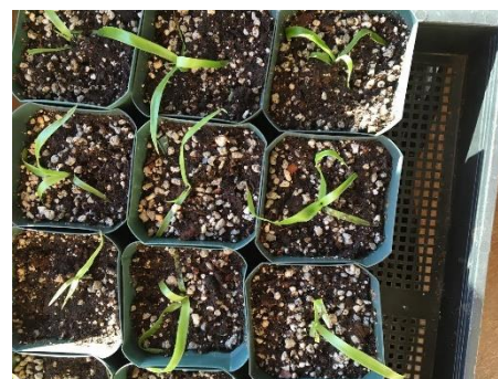
Tiny Aechmea metertensii grown from seed

Here are pictures of Aechmea metertensii :