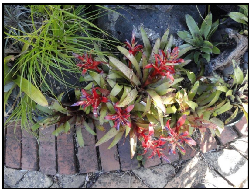
Tillandsia leiboldiana (left) Tillandsia (right) Garden view (bottom)